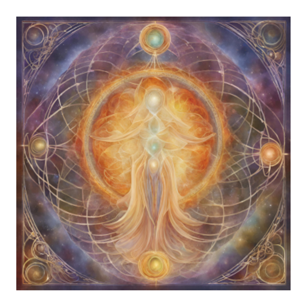
Sunday "Be still, and know that I am God."

now fully manifest them. Peace flows like a river through my mind and I thank Thee, O God, that I am one with Three.